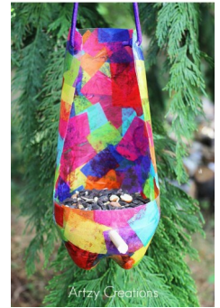
Recycled Bird Feeder For Kids

Recycled Bottle Birdfeeder: Create a unique birdfeeder out of a recycled two-liter soda bottle. Decorate the bottle with tissue paper and Mod Podge. Ages 6-12. Registration is required.